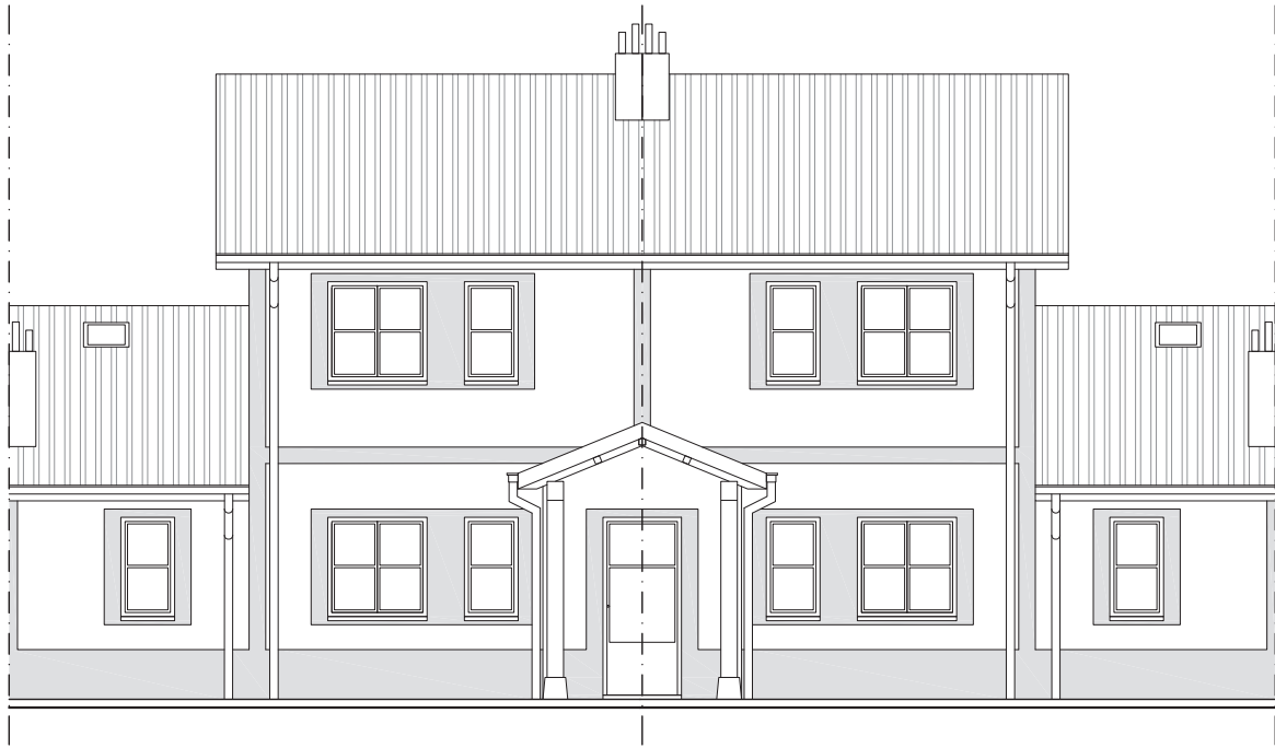
ALZADO PRINCIPAL VIV. 6C y 6E