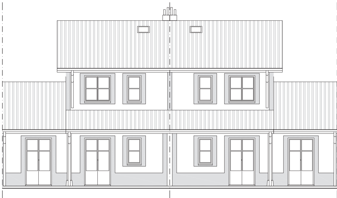
ALZADO POSTERIOR VIV. 6B y 6D